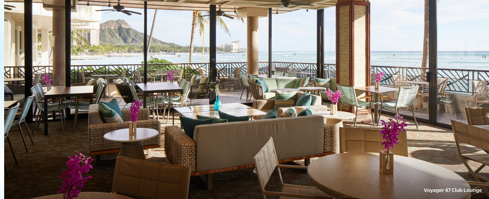
Voyager 47 Club Lounge

Venue spaces as impressive as the breathtaking views of Waikīkī Beach and Diamond Head.