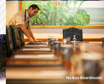
Na Koa Boardroom